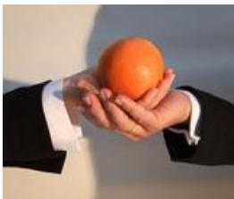
AMACI 2011