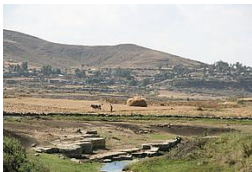
Äthiopien 2011

Environmental Investments and Sustainability (GAFÉIAS, since 2009) Human Resource Management (ahc - austrian human consult, since 2012) Urban- and Regional Research, Spatial Analysis (ÖAW, 1982-2001) Association- and Congress-management (vereint, AMACI, 2001-2011)