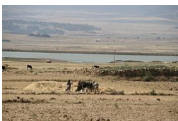
Ethiopia 2011

GAFÉIAS – Global Association for Environmental Investments and Sustainability of Economic, Social and Environmental Spheres (NGO)