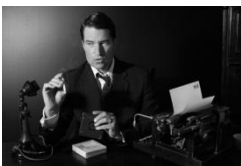
IT Detective © M. Dvorak 2007