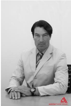
Andreas Andiel © ahc 2012